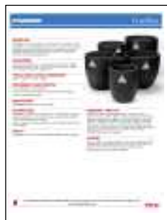
STARRBIDE Roller-Formed SIC