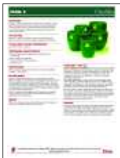
EXCEL E Roller-Formed SIC