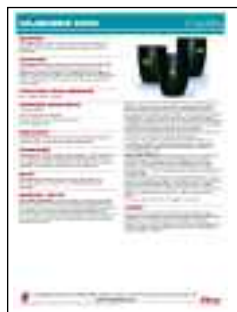
SALAMANDER SUPER Clay Graphite