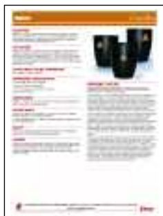
INDUX Clay Graphite