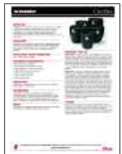
ULTRAMELT ISO-Pressed SIC