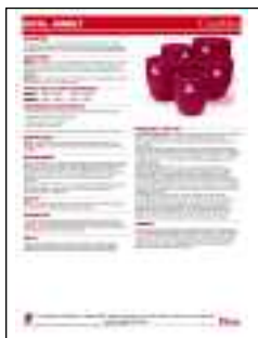
EXCEL, HIMELT Roller-Formed SIC